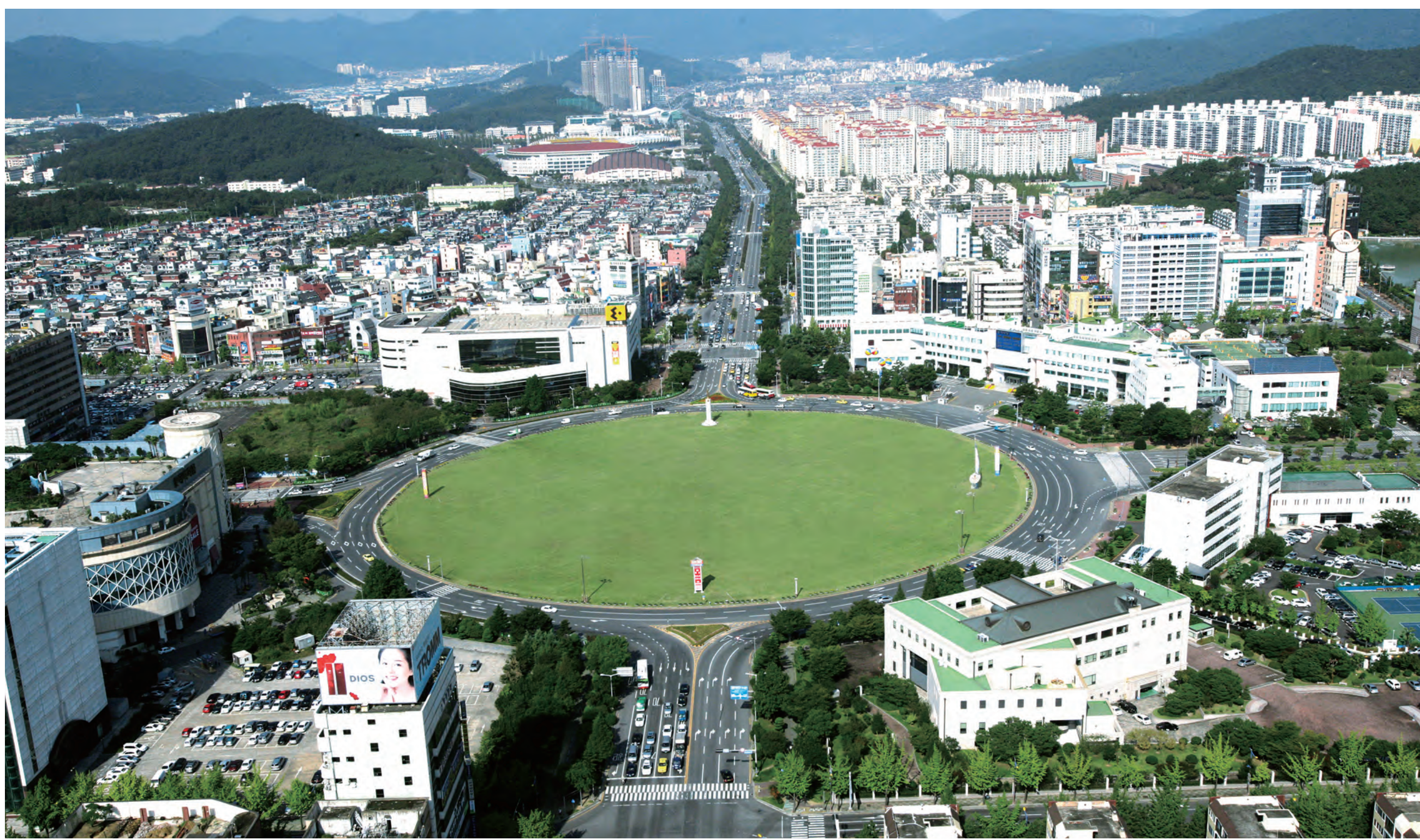
昌原市の全景 Changwon city landscape