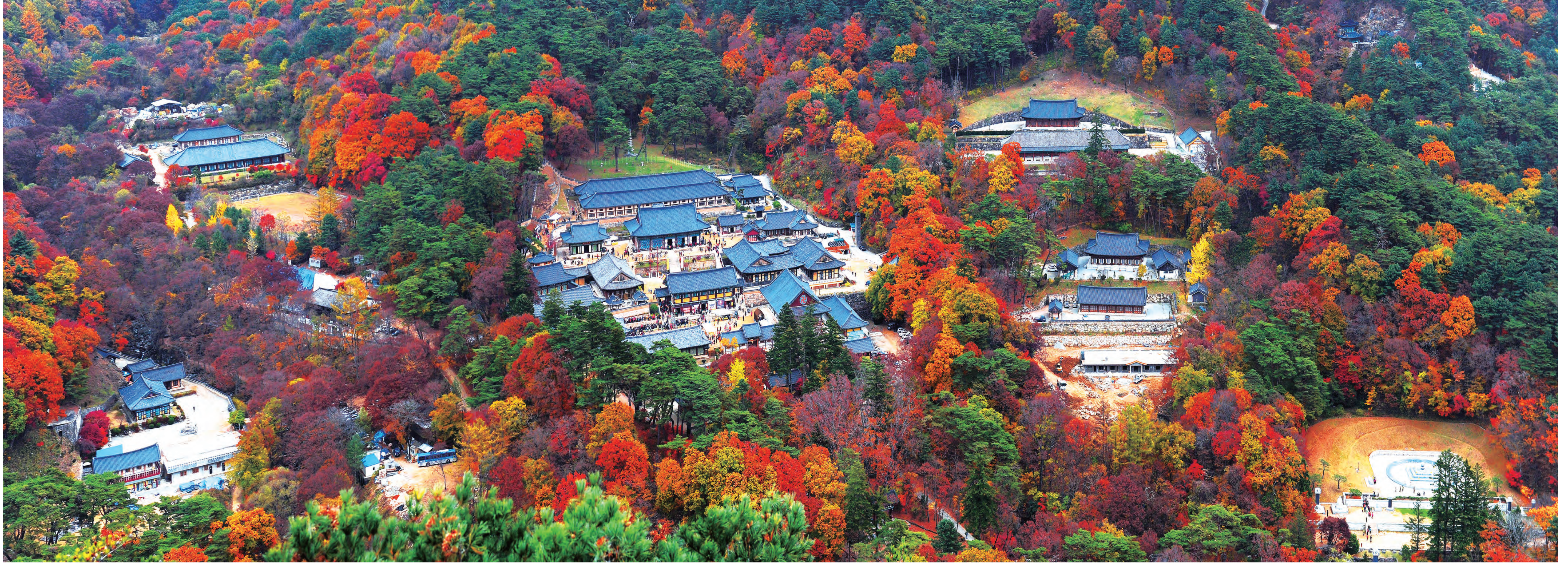
海印寺の全景(陝川郡) Panoramic view of Haeinsa Temple (Hapcheon County)