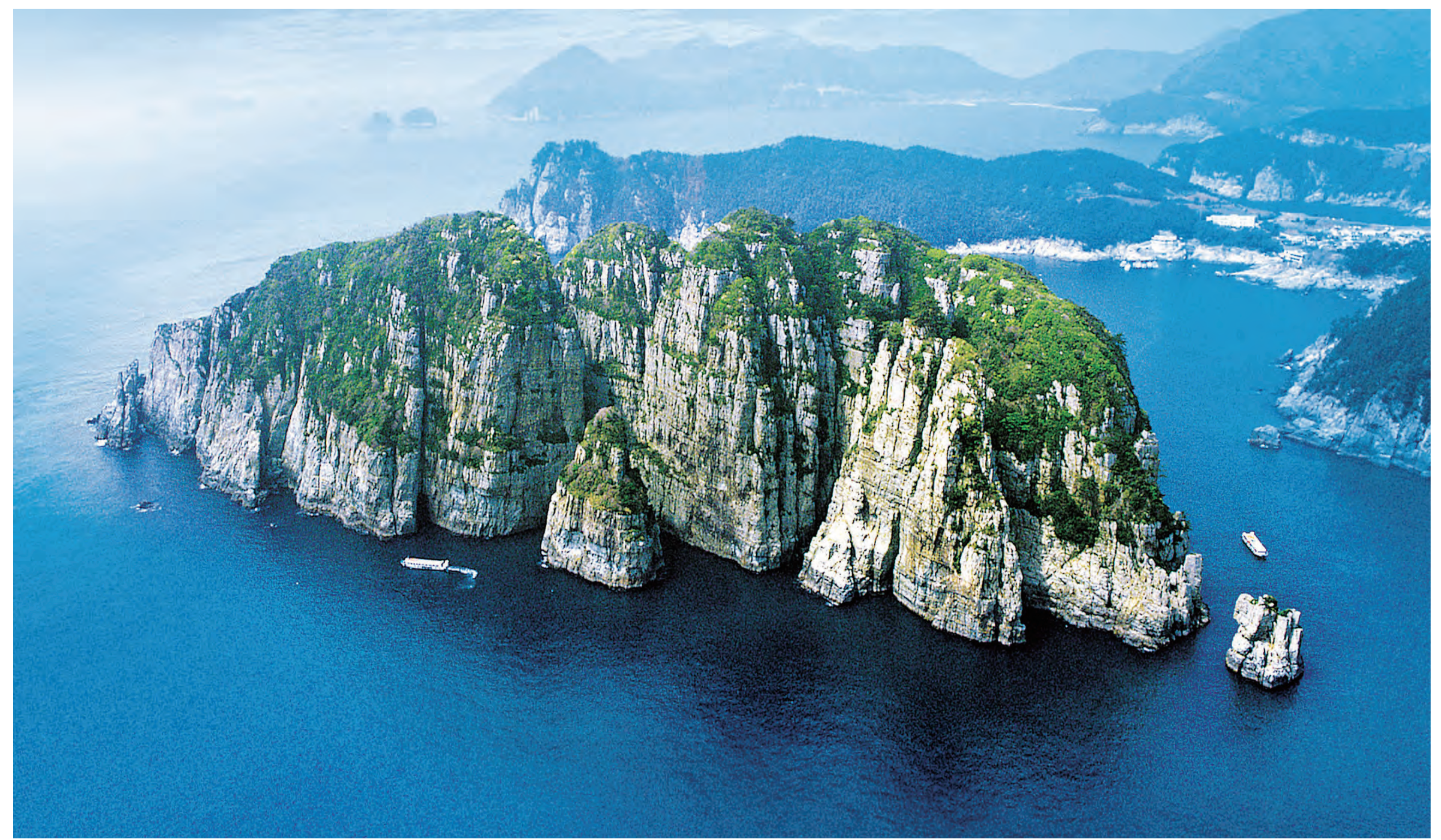
海金剛(巨濟市) Heugungang (Geoje City)