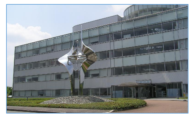
Riken Harima Campus, Japan Synchrotron Radiation Research Institute(JASRI)