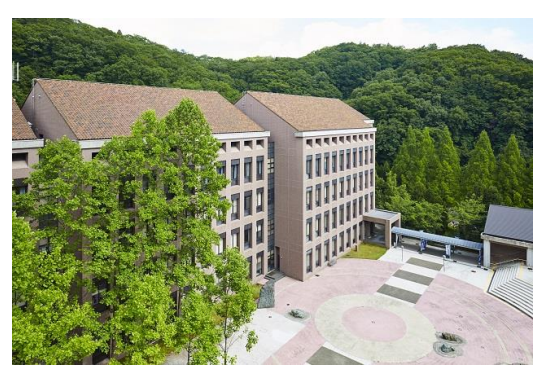
University of Hyogo, Dept. of Science