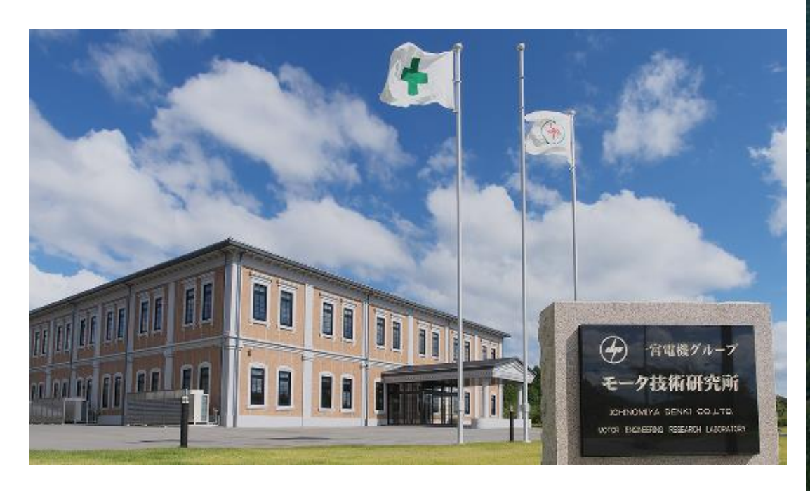
Ichinomiya Denki Co. LTD

All within a rich environment of research and academia