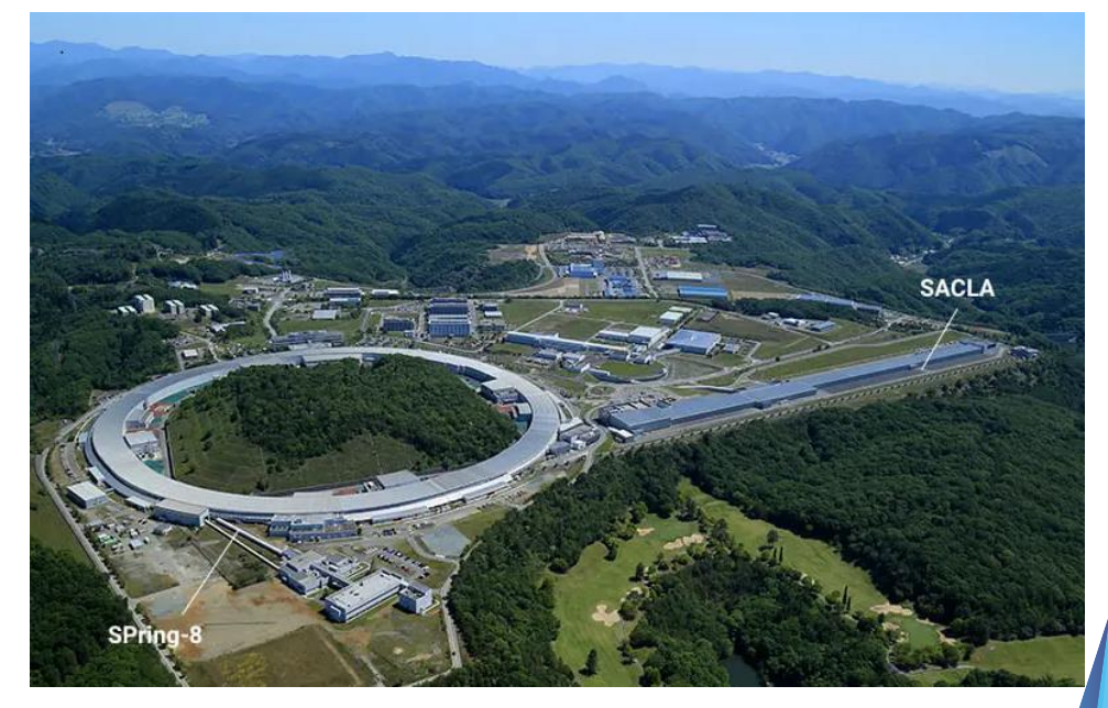
Spring-8 and SACLA