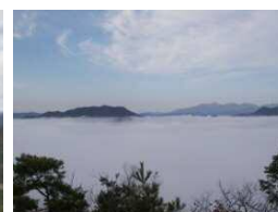
Sea of clouds