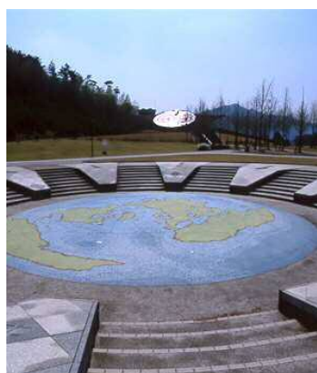
Ginga-no-Hiroba (Galaxy Plaza)