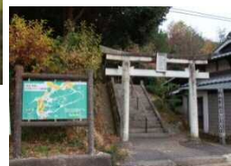
Maesaka route entrance