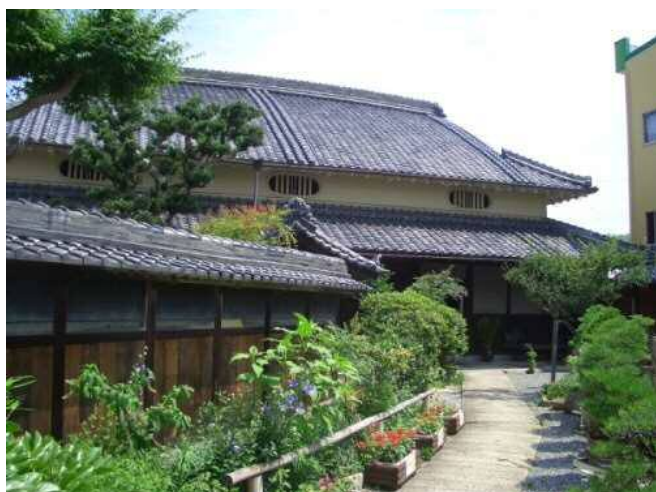
Old Kishi Family House