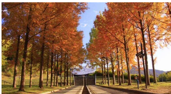
Nishiwaki Keiido Chikyu Kagakukan (Nishiwaki Longitude and Latitude Earth Science Observatory (Terra Dome))