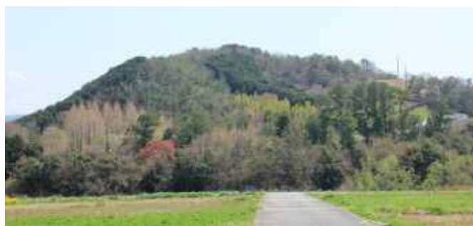
Okanoyama Kofun Ancient Burial