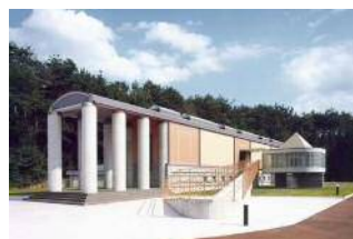
Okanoyama Museum Of Art Nishiwaki