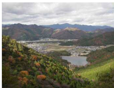
Autumn leaves of Hakusan