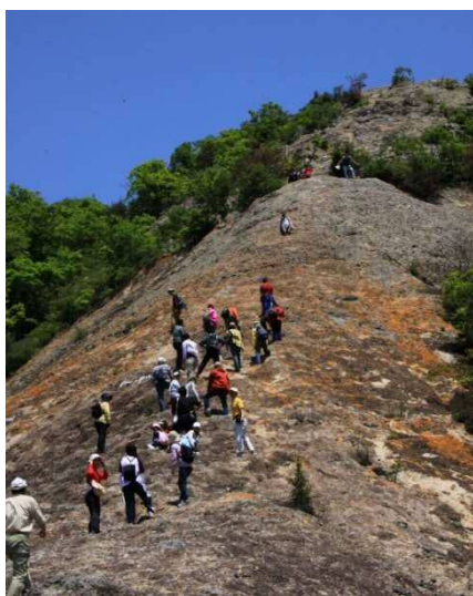
Rocky stretch on the way to Mt. Beniyama

: Mt. Beniyama, Mt. Ono Fuji, and nature-rich satoyama-rin (community-based forest)