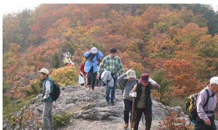
Walking route during the autumn colors