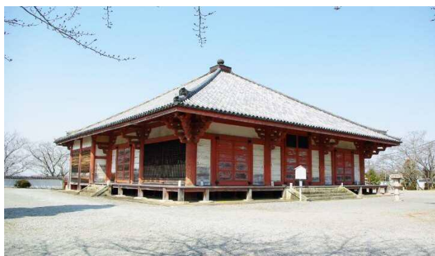
Jodo-do Hall of Jodo-ji Temple

: The national treasure Jodo-do Hall (The Pure Land Hall) and seasonal flowers