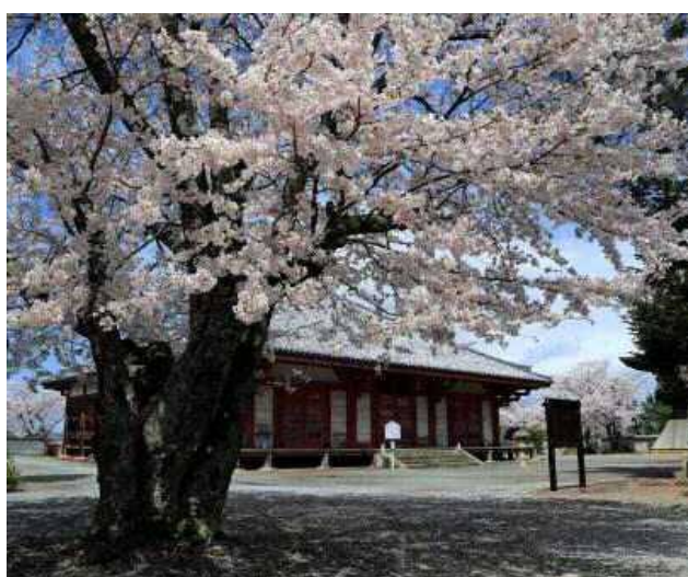
“National treasure and cherry blossoms” Photo contributed by: Masao Kawai (“Hometown Kitaharima That I Want To Preserve Photo Contest” prize-winning photo)