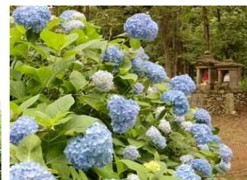
Hydrangeas in the mountain behind Jodo-ji Temple