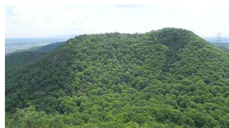
Mt. Ono Fuji seen from Mt. Beniyama