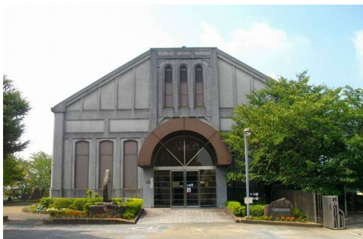
Ono Shiritsu Kokokan