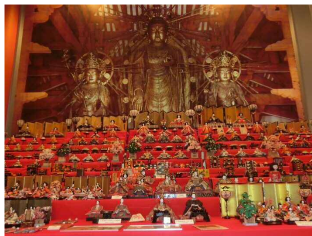
“Big Hinamatsuri” event (Doll Festival)