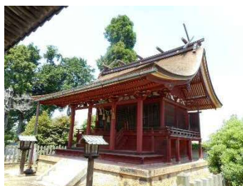
Main Hall of Hachiman-jinja Shrine