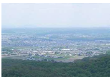
Overlooking Ono City from Mt. Beniyama