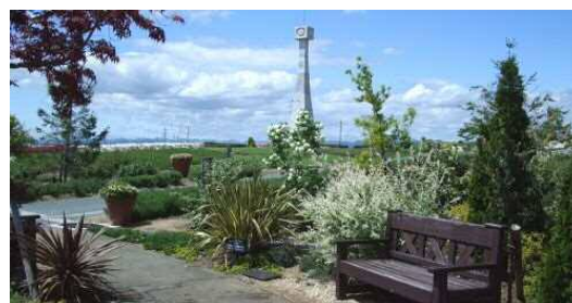
Hana-no-komichi (Flower Lane)